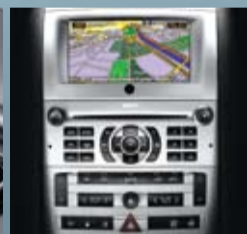
JBL 240w 10 speaker Hi-Fi Stereo with 6 disc CD changer, MP3 and GPS