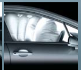
7 SRS airbags with front passenger deactivation