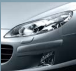
Auto Xenon headlights with auto level adjust