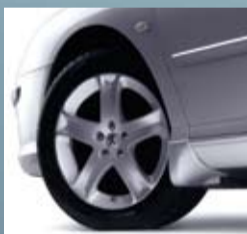
17in alloy with ABS + EBD + EBA + ESP