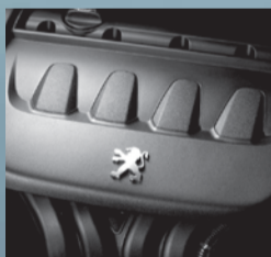
2 litre, EFI DOHC 16v with VVT Power: 140hp @ 6000 rpm, Torque: 200nm @ 4000 rpm